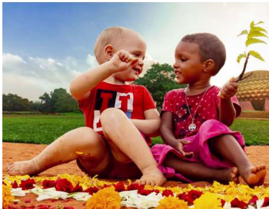
Right Bottom. Kids playing at Matrimandir.