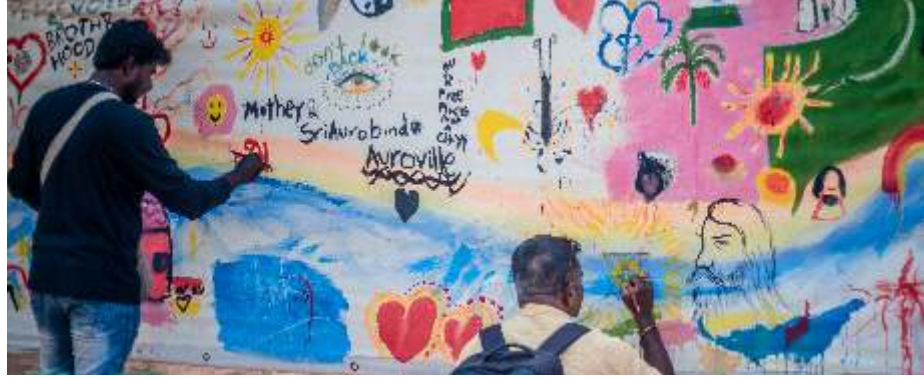
Right Top. Auroville residents expressing themselves with public art, during Auroville Festival.

Auroville's recent asset reset is a bold move aimed at shaking up the City's power structures and creating a more equitable and collaborative model of governance. By resetting the assets, the City is taking a step towards breaking free from the feudal system of control that has been in place for too long. The reset is a necessary move to ensure that all members of the City have an equal say in the decision-making processes and to promote transparency and accountability.