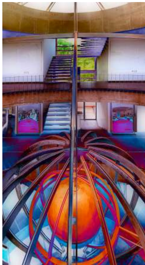
Right Bottom. ACUR, Town Hall, Auroville.