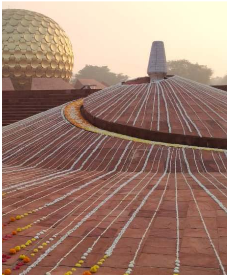
Right Bottom. Flower decoration at Amphitheatre, on Auroville Day.